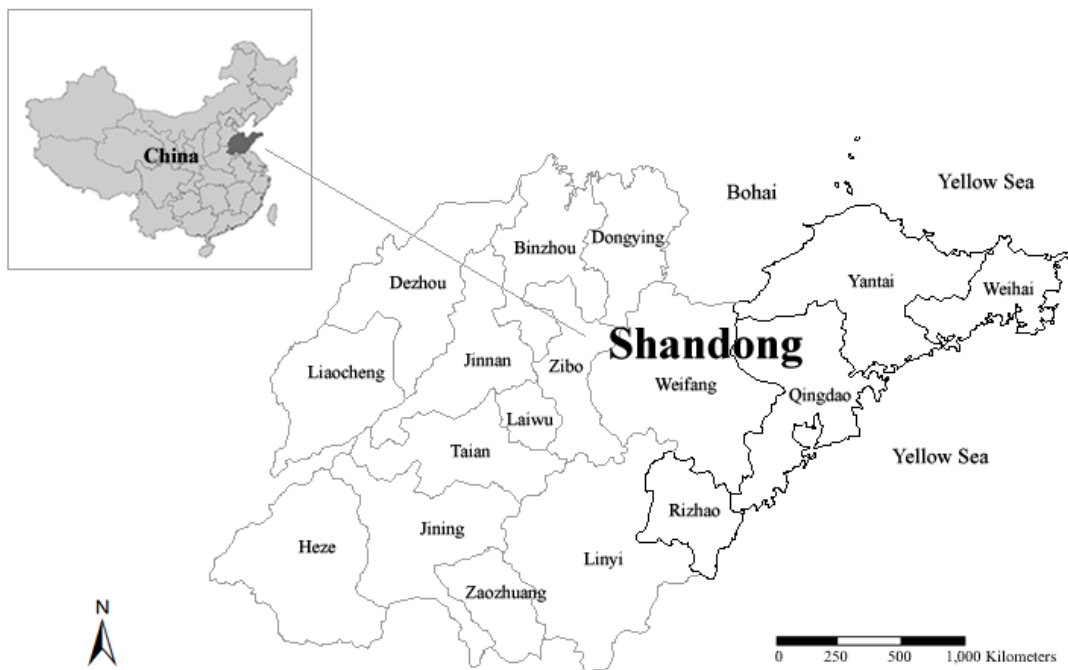
Fig.1 Geographical location and extent of Shandong

Answering these questions can help to incorporate ecosystem values into decision making and lead to well-informed coastal management policy. However, there has been little, if any, research on economic valuation of ecosystem services in Shandong. The absence of quantification of the benefits related to the coast has meant that most existing policies and decisions lack reasonable and convincing foundation. Moreover the coastal ecosystems are already under serious threat due to ignoring and neglecting their benefits during development and exploitation.